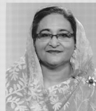
Her Excellency Sheikh Hasina, Honorable Prime Minister of the People's Republic of Bangladesh

7-1, Meieki 4-chome, Nakamura-ku, Nagoya-shi, Aichi +81-(0)52-527-1111