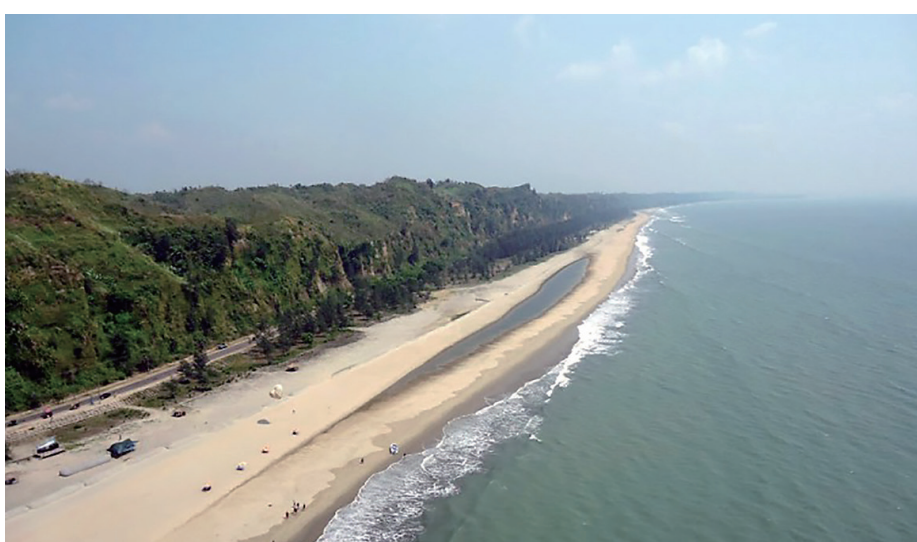
Bangladesh has the longest unbroken natural sea beach in the world stretching over 120 km in Cox's Bazar.

Dhaka Metro's MRT Line-6, Bangladesh's first Mass Rapid Transit (MRT) system covering about 20 kilometers through a fully elevated track, is scheduled to start commercial services in December this year. Japan has extended official development assistance for the MRT project.