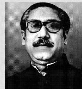
Father of the Nation Bangabandhu Sheikh Mujibur Rahman

CONGRATULATIONS to the People's Republic of Bangladesh on the Occasion of Their Independence Day