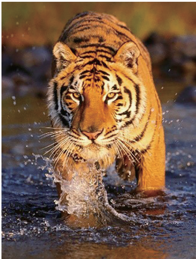
Royal Bengal Tiger