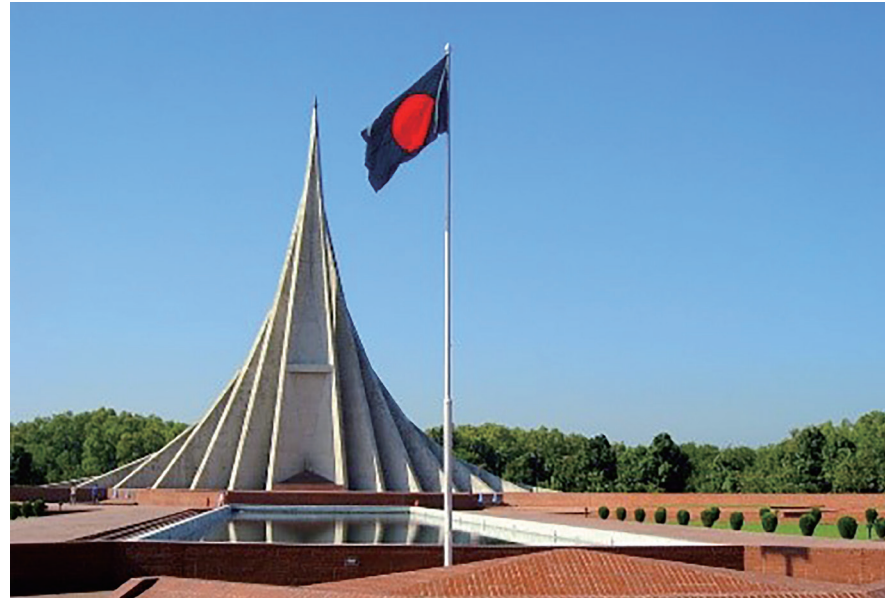
Jatiyo Sriti Soudho (The National Martyrs' Memorial), Savar, Dhaka.

The father of the Bengali nation, President Bangabandhu Sheikh Mujibur Rahman, was released from prison in Pakistan and returned to his beloved independent motherland on January 10, 1972, devoted himself to rebuilding the war-torn country. With the help of allies, as there was an empty treasury, he rehabilitated the displaced people, restored and developed the infrastructure, and put the production sector and the economy on a solid foundation. He approved a constitution within nine months of independence. He made the country the least developed country in just three and a half years. Bangladesh gained recognition from 116 countries and membership in 27 international organizations through his diplomatic efforts. But our misfortune is that the defeated anti-independence clique of '71 continues to conspire against him. Incumbent President Bangabandhu Sheikh Mujibur Rahman was martyred along with his family members on August 15, 1975 by the brutal bullet of the assassin. The murderous Mostaq-Zia and their successors illegally seized power and established a dictatorship in the country. The BNP tarnished the proud history of the Bengali nation by placing the perpetrators of the infer-