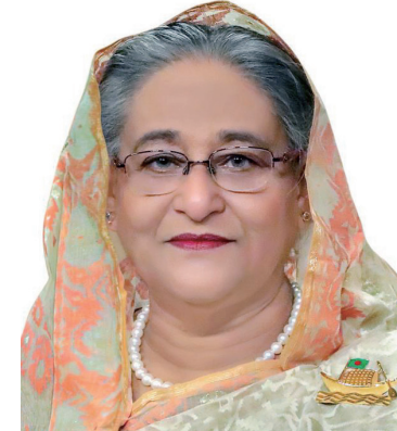
Sheikh Hasina Prime Minister of Bangladesh

In this year of milestone, I am determined to work with Prime Minister