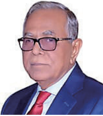
Md. Abdul Hamid President of Bangladesh

On the occasion of 26 March, the Independence and National Day, I extend my heartfelt greetings and warm felicitations to my fellow countrymen living at home and abroad.