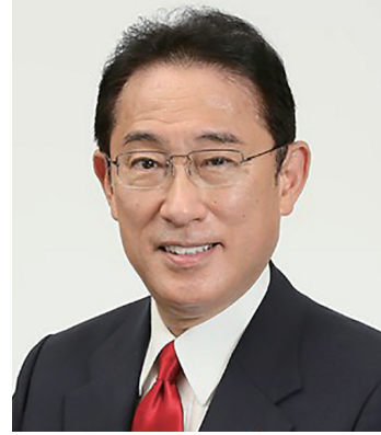
Fumio Kishida Prime Minister of Japan

In order to achieve the desired goal of Independence, we must ensure people-oriented and sustainable development, good governance, social justice, transparency and accountability. Forbearance, human rights and rule of law have to be consolidated for institutionalizing democracy. It is our sacred duty to ensure a safe, happy, beautiful and prosperous Bangladesh for the new generation. By assassinating Bangabandhu on 15 August 1975, anti-