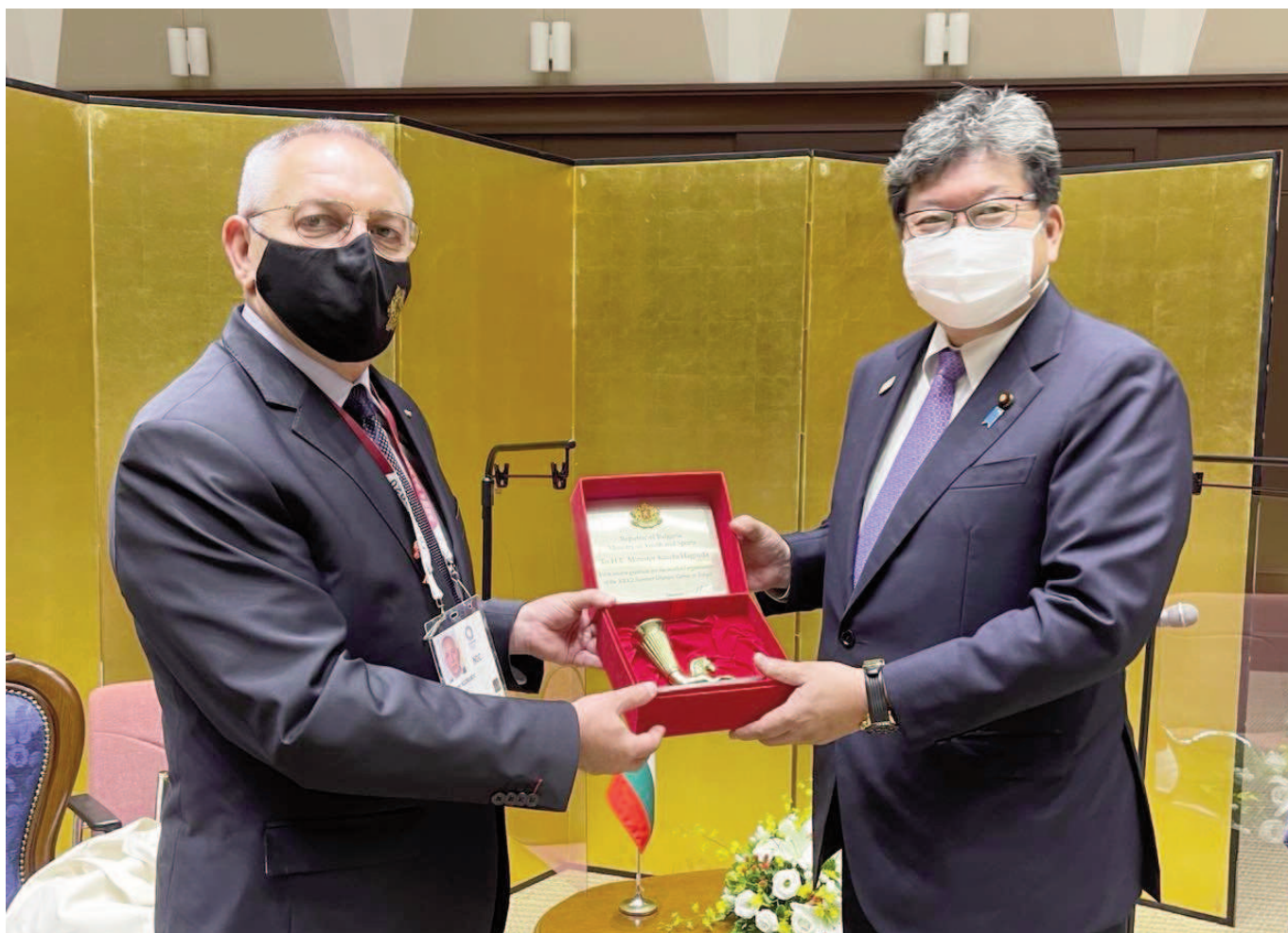
Minister of Youth and Sports of Bulgaria Andrey Kuzmanov meets Japan's then-Minister of Education, Culture, Sports, Science and Technology Koichi Hagiuda, in Tokyo on July 24, 2021.

2021 was highlighted by another memorable event — the Tokyo Olympics. The Minister of Youth and Sports of Bulgaria visited Japan to attend the opening ceremony and held a productive meeting with his Japanese counterpart, the Minister of Education, Culture, Sports, Science and Technology of Japan. Bulgarian athletes performed outstandingly and won six Olympic and two Paralympic medals. Bulgaria's rhythmic gymnastics team won its first ever Olympic gold. Bulgarian athletes