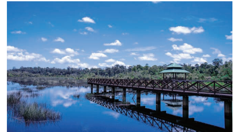
Labi, Luagan Lalak Recreational Park

CONGRATULATIONS on the Occasion of the 38th National Day of Negara Brunei Darussalam