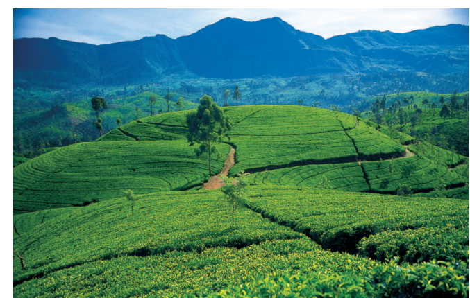
A Ceylon Tea plantation