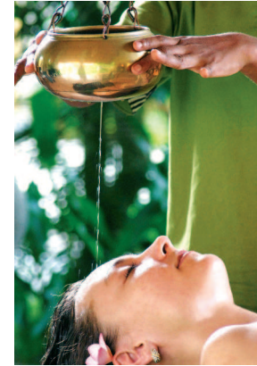
Sri Lankan Ayurveda

dom, is fully capable of remaining undaunted and facing up to this challenge as well. As a nation accustomed to unceasingly fighting for independence, on this Independence Day, let us resolve to overcome these challenges as well.