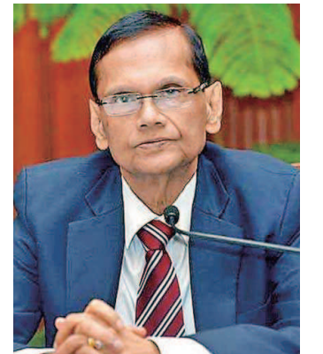
Foreign Minister Professor G. L. Peiris

On the happy occasion of the National Day of Sri Lanka, marking our country's 74th anniversary of independence from four and a half centuries of foreign colonial rule, it is with immense pride and pleasure that I extend my warm felicitations and sincere greetings to fellow citizens, both in Sri Lanka and spread across all parts of the world.