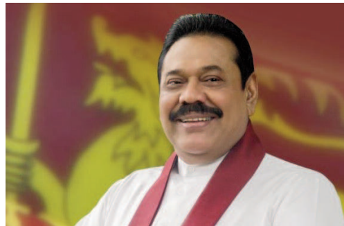
Prime Minister Mahinda Rajapaksa

Whilst historically, the people of this country had lost their freedom due to foreign invasions and separatist terrorism, today we have lost our freedoms due to the Covid pandemic which deprived us of the opportunity to develop the country for two years. The economy, education and