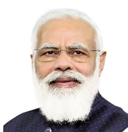
Hon'ble Prime Minister Narendra Modi

Important initiatives such as India-Japan Industrial Partnership, Investment Promotion Partnership, Digital Partnership and Supply Chain Resilience Initiative are focused on result-oriented outcomes for ensuring mutually beneficial economic security. These capacity building and economic development frameworks enable synergies between Japan's Society 5.0 and Green Growth Strategy with India's "Aatmanirbhar Bharat - Self reliant India," "Make in India", "Digital India", "Startup India" and "Skill India" initiatives. With rapid-