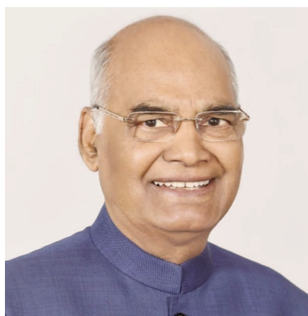
Hon'ble President Ram Nath Kovind

With its 650 million skilled young demographic dividend, India continues to take proactive steps to maintain its high-growth trajectory towards the goal of becoming a $5 trillion economy. Policy reforms and initiatives undertaken by the Government