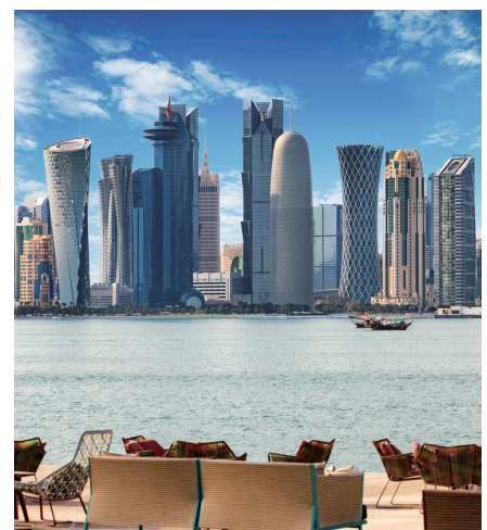
Doha's skyline