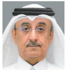
Hassan Bin Mohammed Rafei Al-Emadi

Today the State of Qatar celebrates its National Day, the glorious anniversary of our founding of our beloved country. Dec. 18 is a day when the people of the State of Qatar remember the sacrifices and achievements of the nation's founders, our fathers and grandfathers, and their heroic roles and epics in achieving the unity of our country, affirming its sovereignty, preserving its heritage and building the modern state.