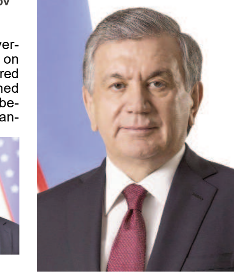
President Shavkat Mirziyoyev

New Uzbekistan also means new economic relations, complete restructuring of the economic system and full implementation of market mechanisms. The priority of such reforms is support for business, protection of entrepreneurship and private property. An important role is played by the determination of points of growth, increasing the competitiveness of the economy. These measures have a positive im-