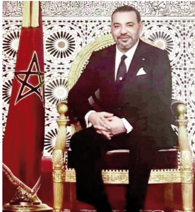
His Majesty King Mohammed VI

Lastly, I would like to commend the excellence of the relations between Morocco and Japan, which have witnessed steadfast development on all levels. I am glad to note that over the past 10 years, the number of Japanese companies operating in Morocco has more than doubled, reaching 75 companies, making Morocco the second-largest destination for Japanese companies in Africa.