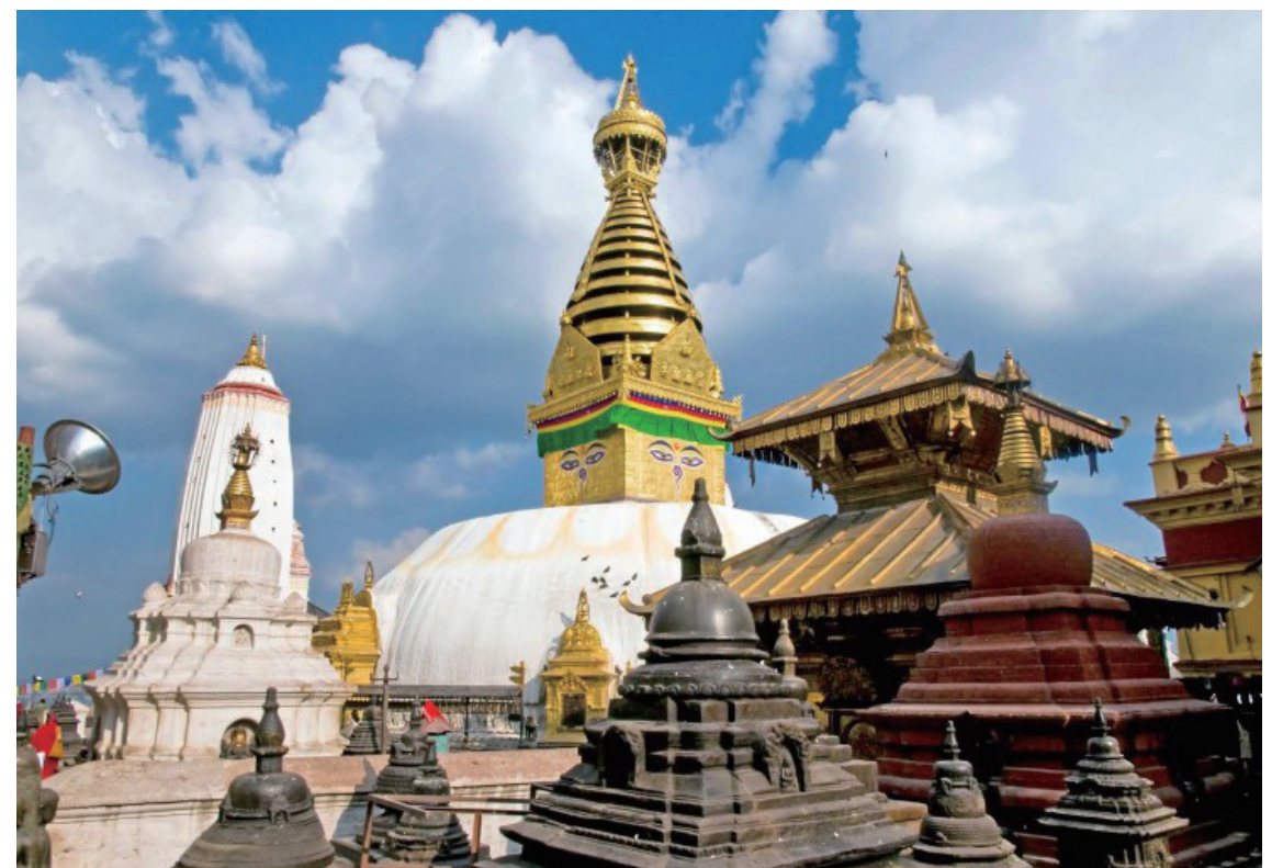
Swayambhunath Temple is an ancient religious complex built on a hillock in the Kathmandu Valley, west of Kathmandu. Its stupa, the oldest of its kind in Nepal, is believed to date back to 460 A.D.