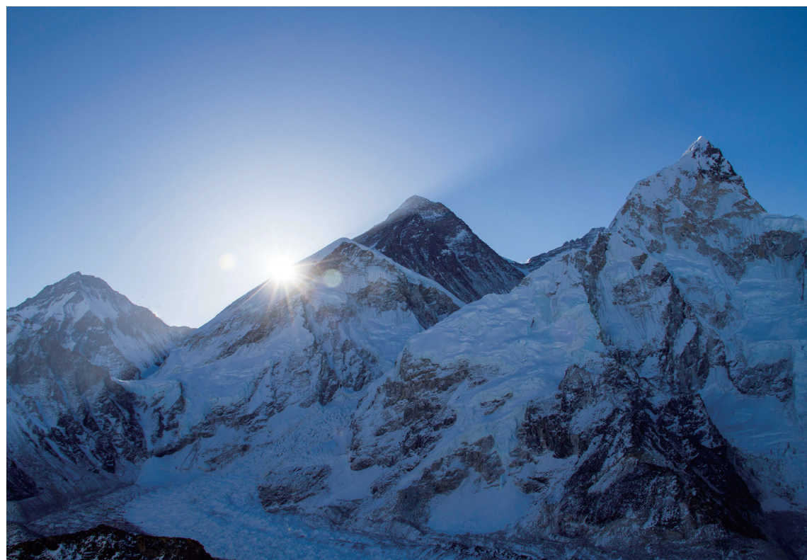
Mt. Everest, the highest mountain on Earth, with its elevation of 8,848.86 meters above sea level, attracts tourists to the nearby region. Nearly 58,000 tourists reportedly visited the area in fiscal 2022-23.