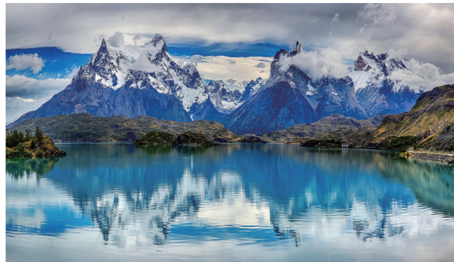
Imagen de Chile

This October, we will join efforts with Waseda University and the Instituto Cervantes of Tokyo in a Symposium on Modern Latin-American Literature, in which Chilean writer Carlos Franz will be present, together with paying a tribute to renowned Chilean writer and journalist José Donoso.