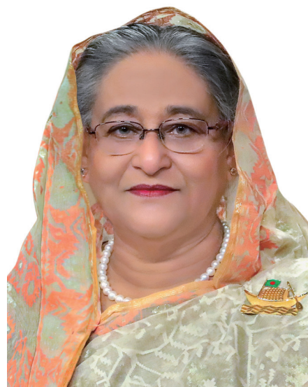
Sheikh Hasina Prime Minister of Bangladesh

Today is the great Independence and National Day. On this auspicious occasion, I extend my sincere greetings and congratulations to all the Bangladeshi citizens living in the country and abroad.