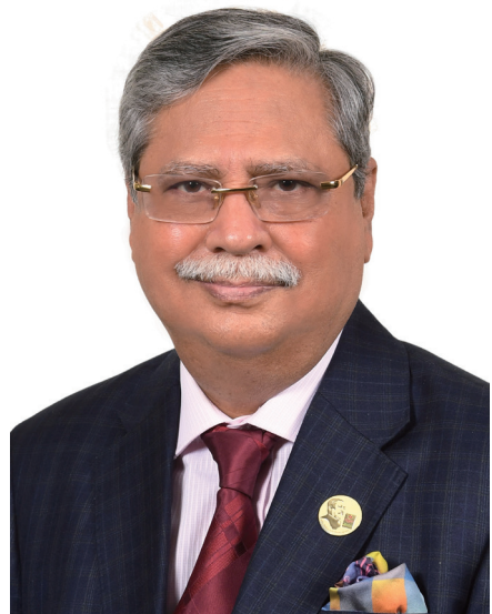
Mohammed Shahabuddin President of Bangladesh

26th March—The Great Independence and National Day of Bangladesh. On this auspicious occasion, I extend my heartfelt greetings and warm felicitations to my fellow countrymen living at home and abroad.