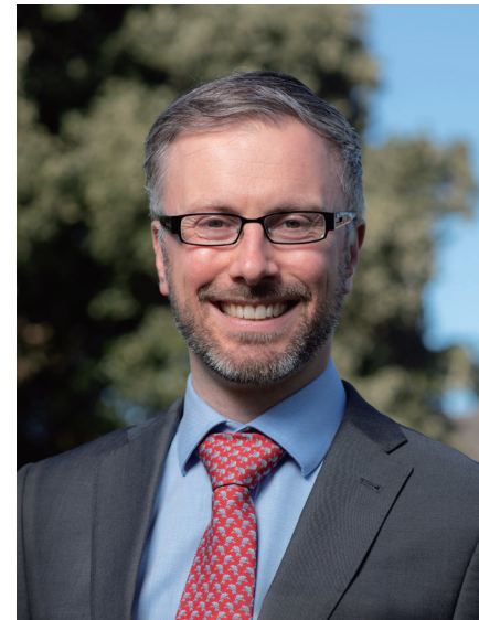
Department of Children, Equality, Disability, Integration and Youth

So, on this St. Patrick's Day, I would like to invite you to join us in wearing something green, supporting your local parade, and joining in the fun and spirit of the day. Lá fhéile Pádraig sona daoibh go léir!