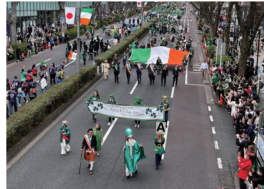
Embassy of Ireland Tokyo

Roderic O'Gorman T.D., Ireland's Minister for Children, Equality, Disability, Integration and Youth