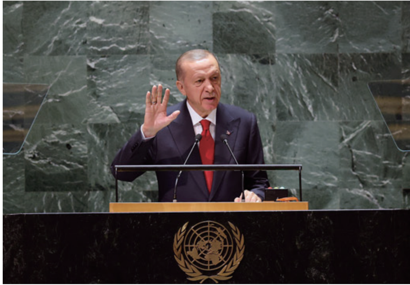
Turkish President Recep Tayyip Erdoğan addresses the 78th session of the U.N. General Assembly on Sept. 19.

Türkiye, with one of the world's most extensive diplomatic networks, has cultivated global alliances, underscoring our commitment to active engagement with the