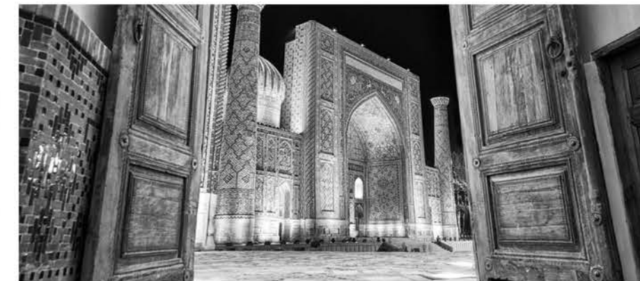
Sherdar Madrasah in Samarkand