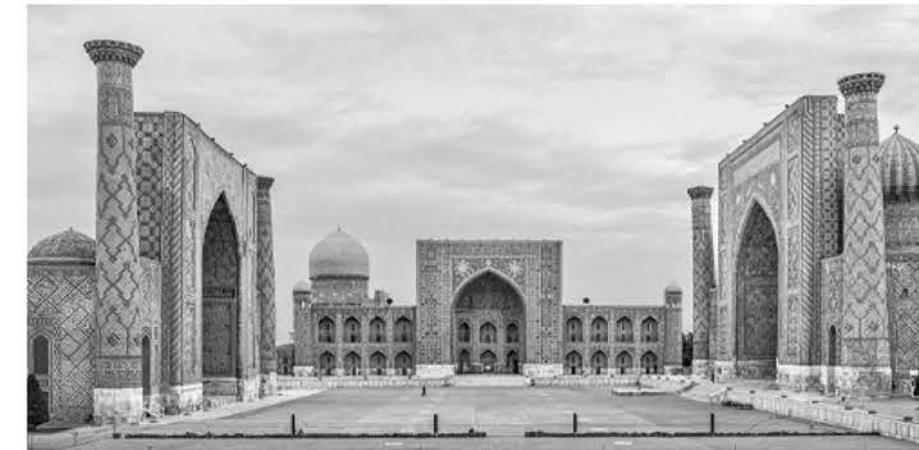
Registan Square in Samarkand

Holding the 25th Session of the General Assembly of the World Tourism Organization (UNWTO) in