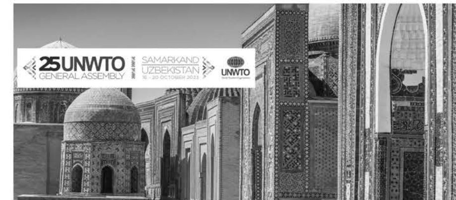
Shah-i-Zinda (meaning "The Living King")

the ancient city of Samarkand will acquaint the world with the cultural, tourism, investment and intellectual potential of our country and serve to further strengthen international ties with the world community in the field of trade, economy, tourism and cul-