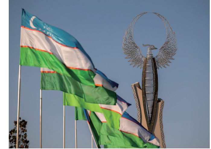
The Independence Monument with Uzbekistan national flags

Currently, there are about 60 joint ventures in Uzbekistan with Japanese investments. Out of those, 30 were established with 100% Japanese capital, while 15 Japanese companies have opened representa-