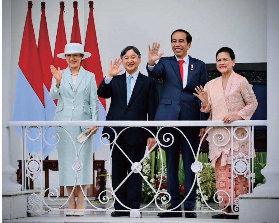
The Emperor and Empress with Indonesian President Joko Widodo and his wife during their visit to Indonesia in June

The year 2023 marks a key milestone in Indonesia and Japan's diplomatic journey, as both nations commemorate the 65th anniversary of diplomatic ties. This long-lasting collaboration has thrived due to