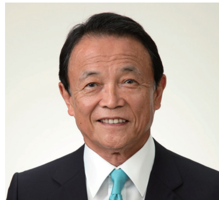
H.E. Mr. ASO Taro President of the Japan-Bangladesh Parliamentary Friendship League

7-1, Meiki 4-chome, Nakamura-ku, Nagoya-shi, Aichi +81-(0)52-527-1111