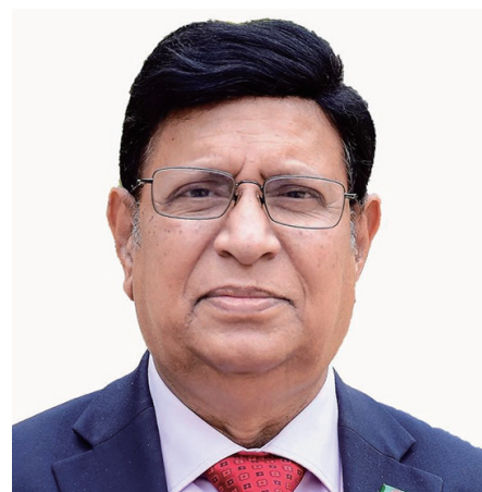
Dr. A.K. Abdul Momen, MP Foreign Minister of Bangladesh

Today is 26th March, the Great Independence and National Day. On this auspicious occasion, I extend my sincere greetings and congratulations to all Bangladeshis living in the country and abroad.