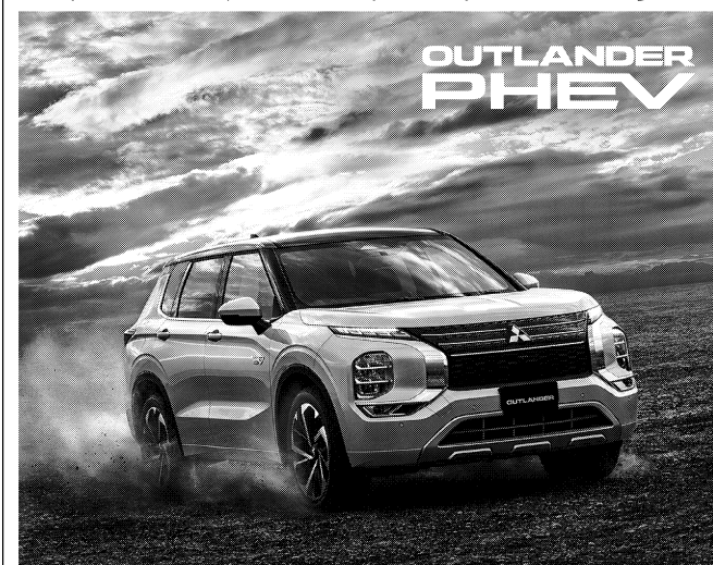
Photo: P with optional equipment Body Color: White Diamond / Black Mica (Additional price) https://www.mitsubishi-motors.co.jp/lineup/outlander_phev/

Congratulations on the 52nd Anniversary of the Independence Day of the People's Republic of Bangladesh