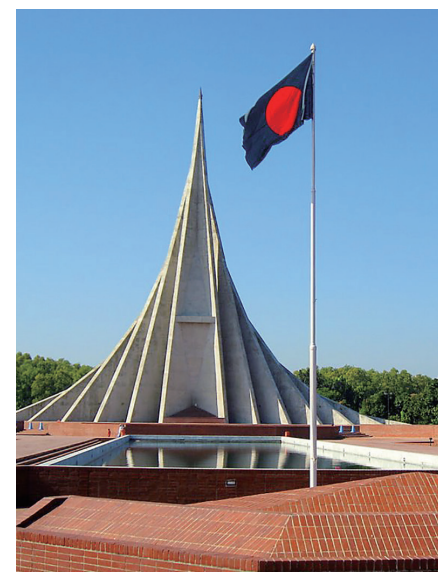
Jatiyo Sriti Soudho (the National Martyrs' Memorial), Savar, Dhaka