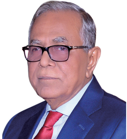
Md. Abdul Hamid President of Bangladesh

Today 26th March. The great Independence and National Day. On this occasion, I extend my heartfelt greetings and warm felicitations to my fellow countrymen living at home and abroad.