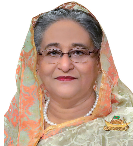
Sheikh Hasina Prime Minister of Bangladesh

Today is the great Independence and National Day. Bangladesh entered its 52nd year after the golden jubilee of independence. On this auspicious occasion, I extend my sincere greetings and congratulations to all the Bangladeshi citizens living in the country and abroad.