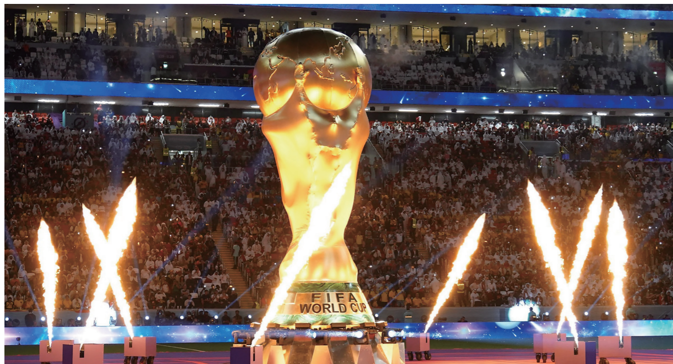
The opening ceremony of FIFA World Cup Qatar 2022 held on Nov. 20, 2022

Since its first production in 1996, Qatargas has successfully delivered LNG to nearly 70 customers in more than 31 countries and is committed to meeting the world's demand for safe, reliable and lower-carbon energy. Through its operational excellence, Qatargas is adding value to its production chain, ensuring efficient energy supplies, creating new markets, contributing to the Qatari economy and supporting the local community in line with Qatar's National Vision 2030. In addition to the LNG facilities, Qatargas operates the Jetty Boil-Off Gas Recovery facility, Al Khaleej Gas, Barzan Gas, three helium plants, two Laffan Refineries (among the largest condensate refineries in the world) and the Ras Laffan Terminal on behalf of its shareholders.