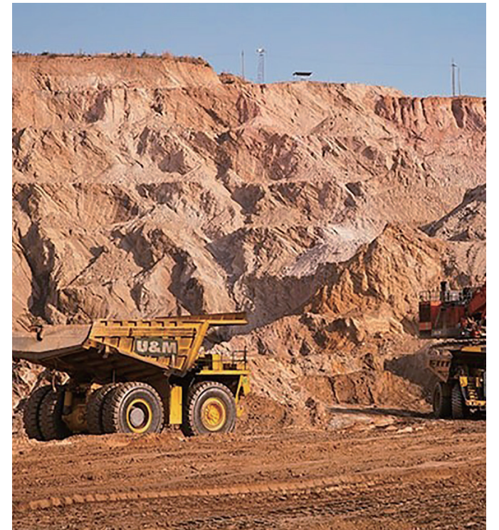
Kalumbila Mine in North Western Province, Zambia, is one of the biggest copper producing mines in Africa.

Zambia and Japan share strong bilateral relations. Zambia is committed to further strengthening and deepening the relationship.