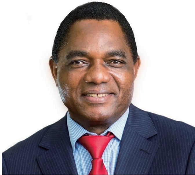
Hakainde Hichilema, President of the Republic of Zambia

to be a trendsetter in economic development and technological advancements, especially in the manufacturing of vehicles, among other fields. Zambia is appealing to Japan to consider increasing investment that will be mutually beneficial for both countries' peo-