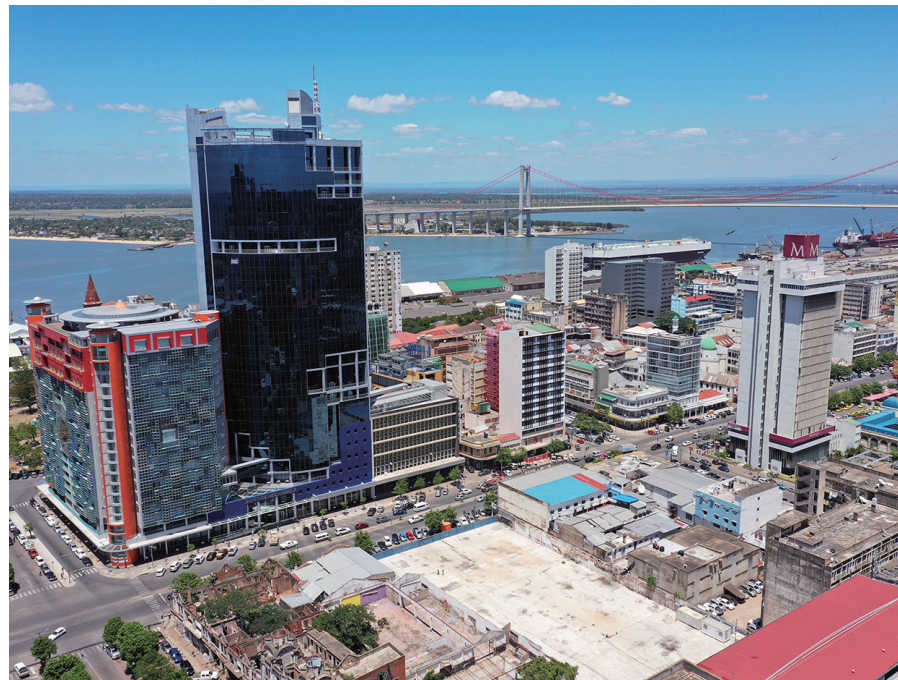
Maputo, capital of Mozambique

sage. To my fellow compatriots in Japan, I extend my congratulations on the occasion of the 47th anniversary of the independence of Mozambique.