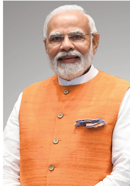
Honorable Prime Minister Narendra Modi

The meeting also highlighted our shared commitment to economic security and the prosperity of our peoples through a robust framework of economic cooperation, tackling the issue of climate change through the Clean Energy Partnership and focus on infrastructure development. In this context, the announcement of the