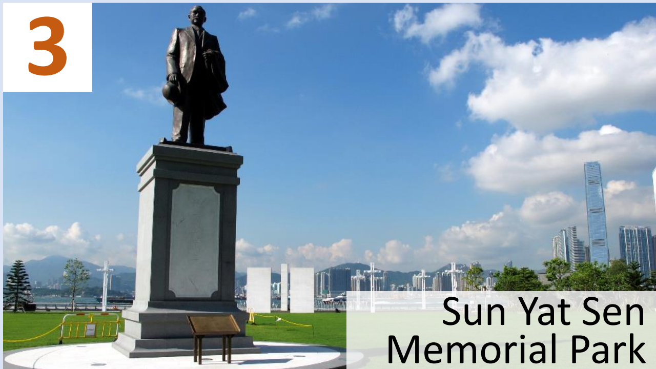
Sun Yat Sen Memorial Park