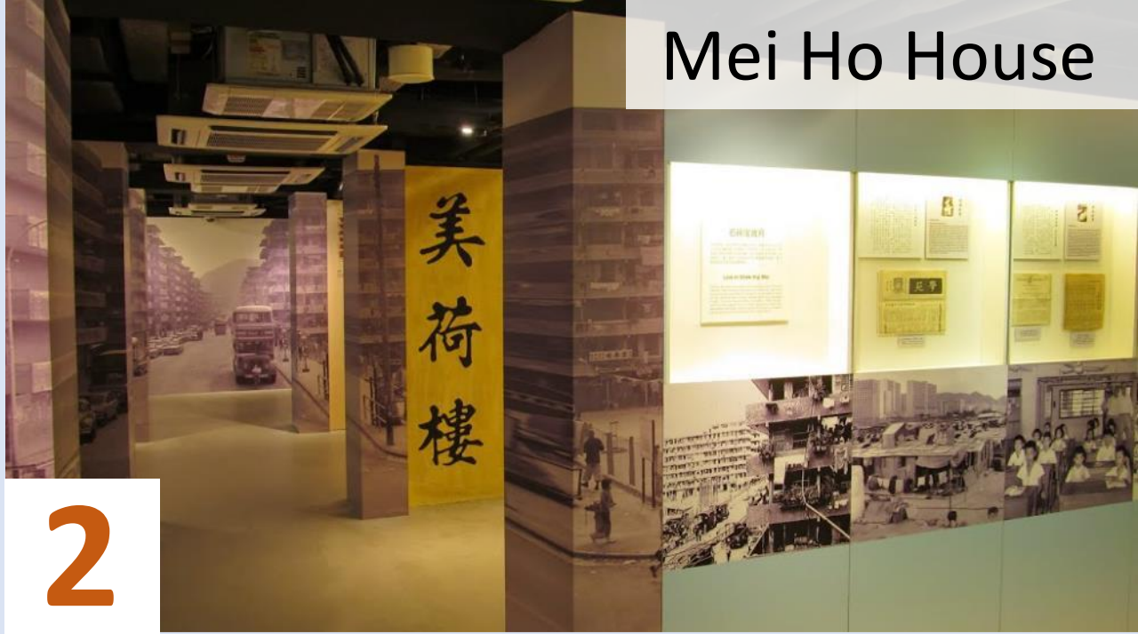
Mei Ho House