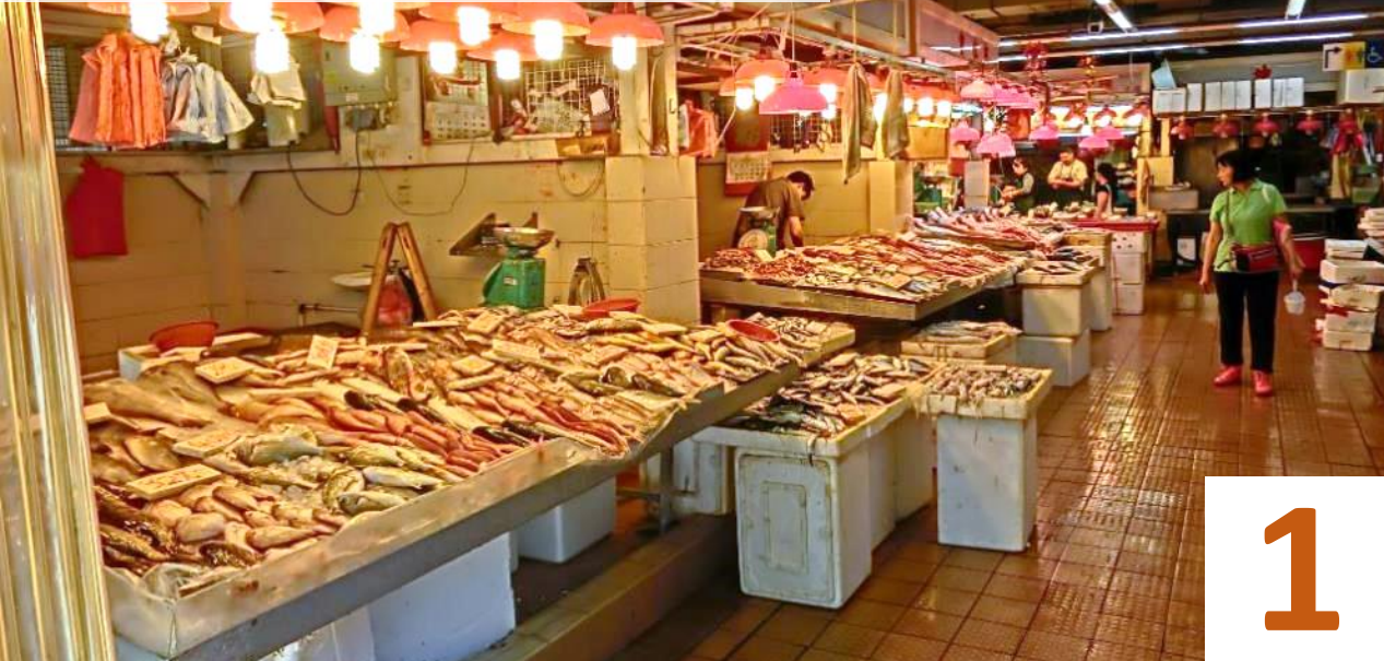
Sai Ying Pun Market