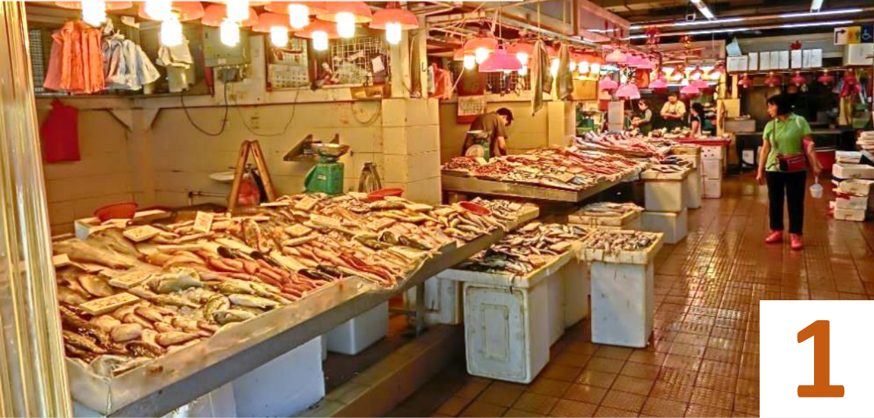
Sai Ying Pun Market