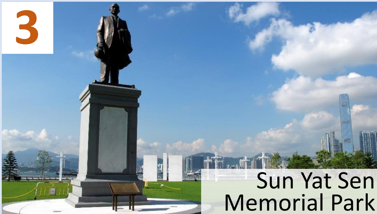
Sun Yat Sen Memorial Park