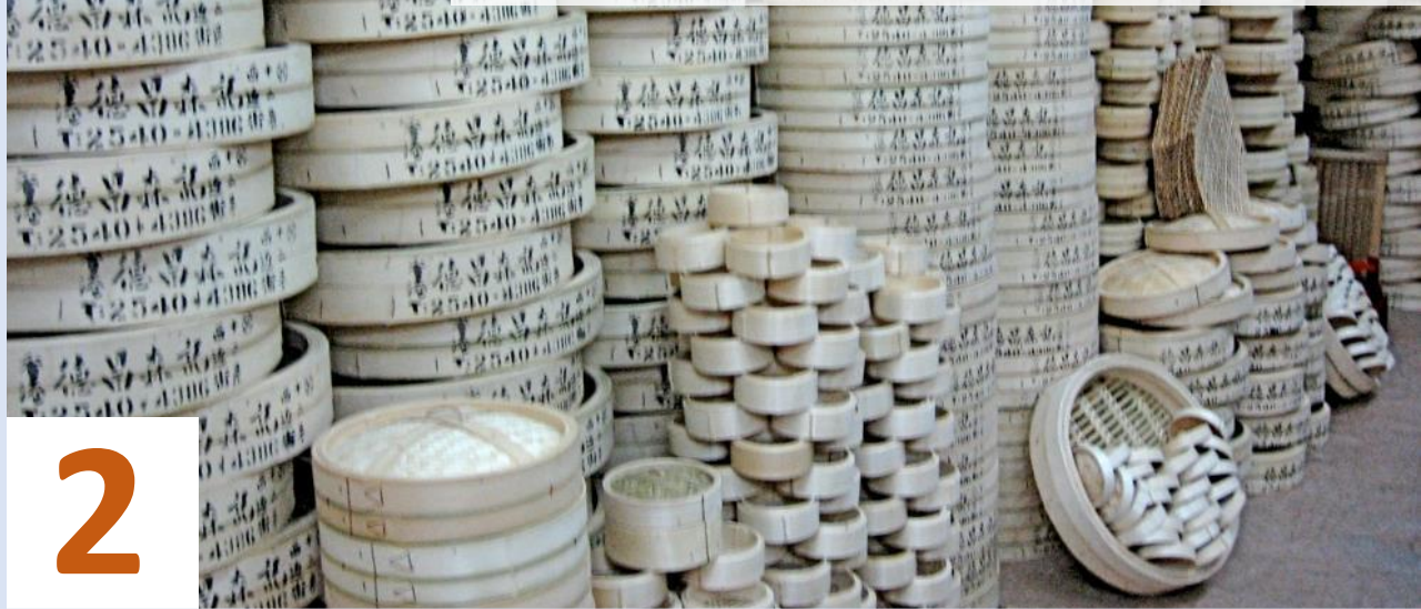
Tuck Chong Sum Kee Bamboo Steamer Company