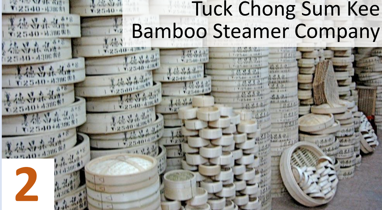
Tuck Chong Sum Kee Bamboo Steamer Company