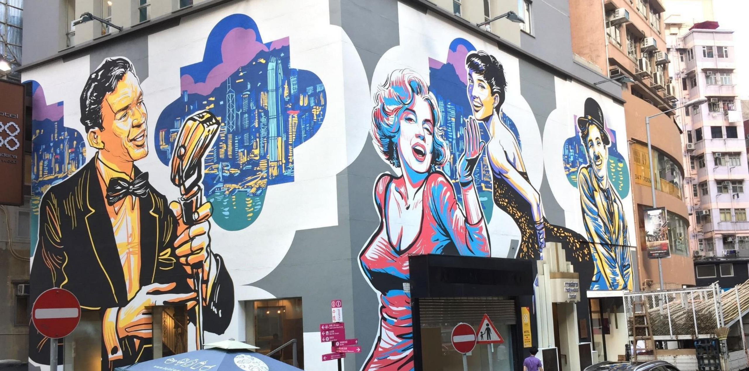
Today's Pivotal Spot: Hong Kong Central