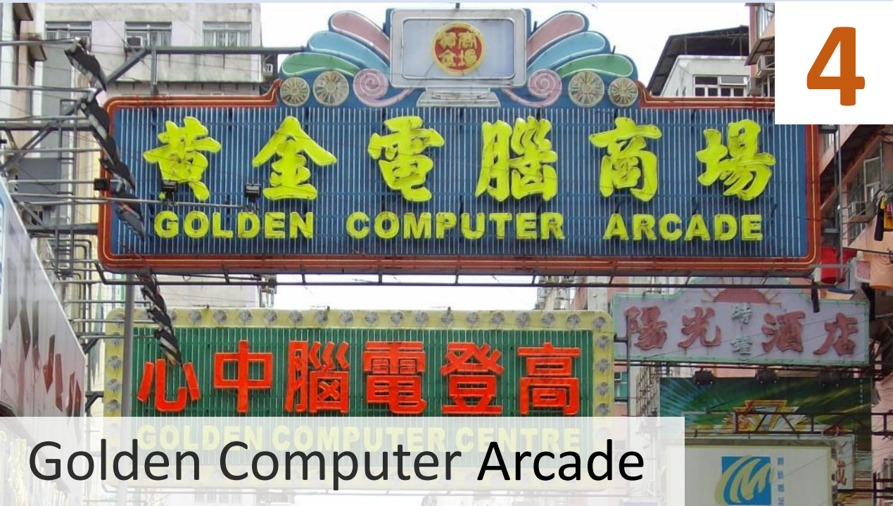
Golden Computer Arcade