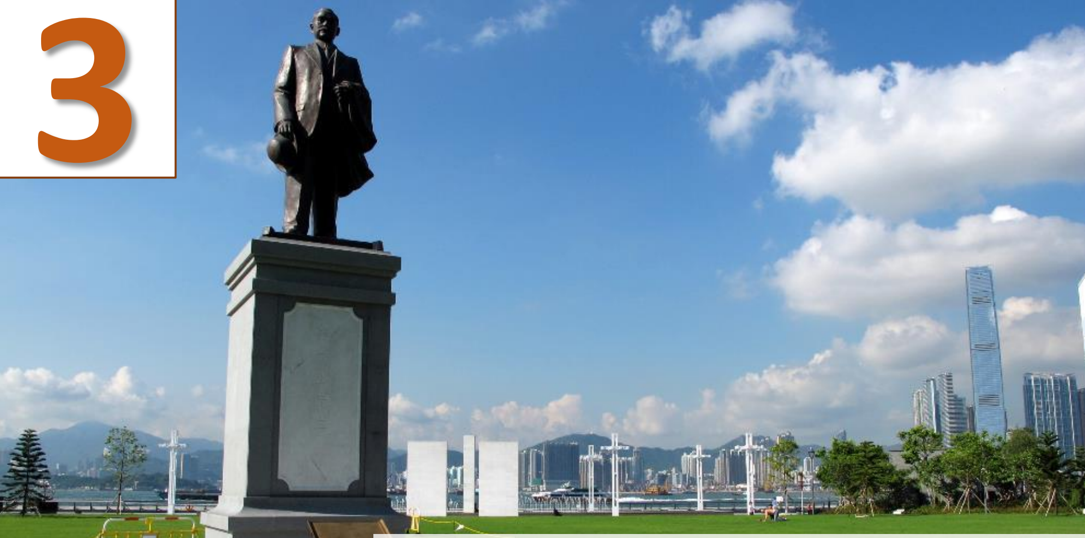
Sun Yat Sen Memorial Park