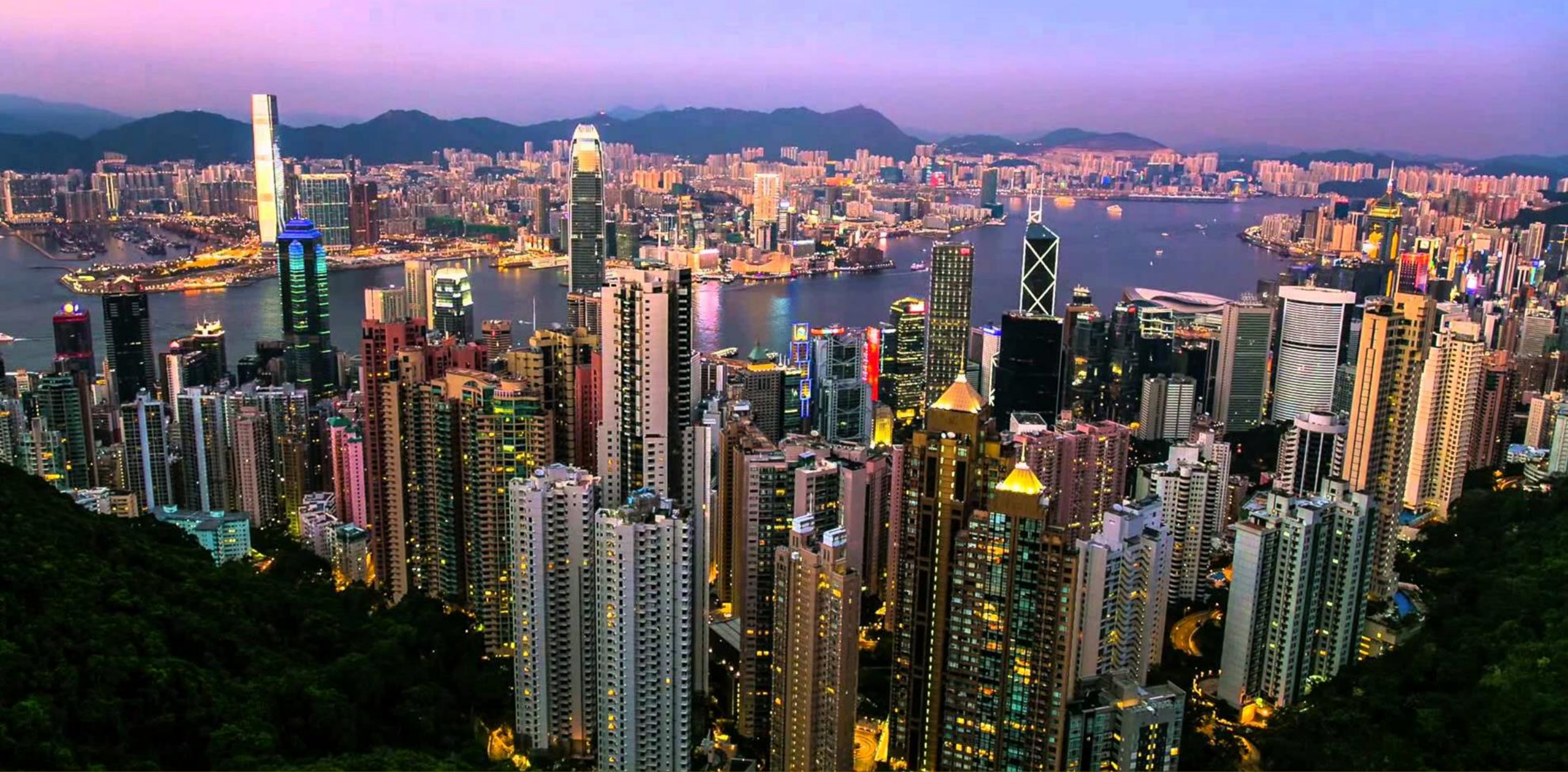
Victoria Peak (Hong Kong Central)