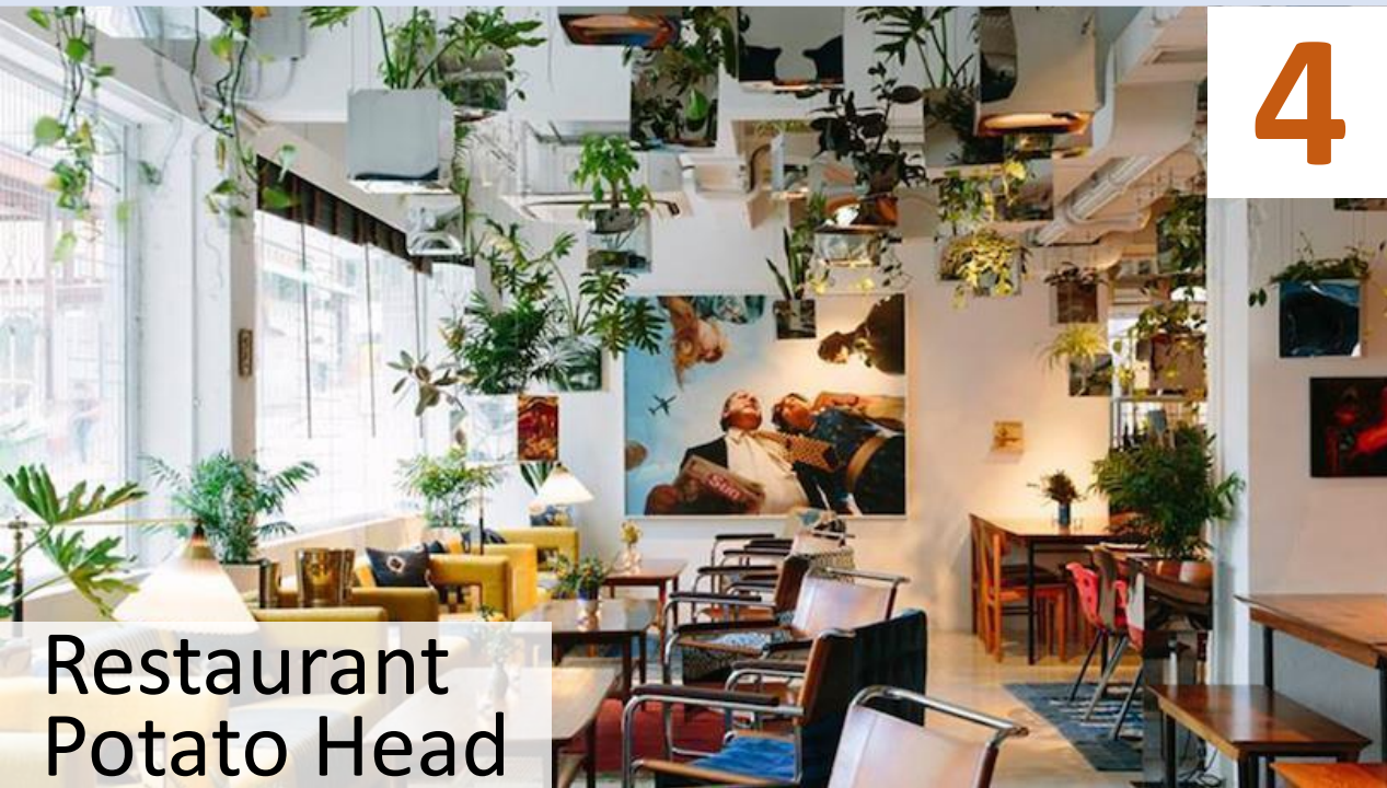
Restaurant Potato Head